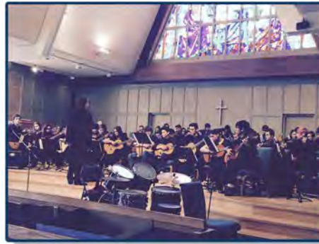
Winnipeg Music Festival