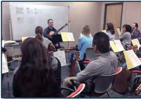
MCGA January PD Event

The MCGA works to promote guitar education and to provide an inclusive and comprehensive music education for all students in Manitoba.