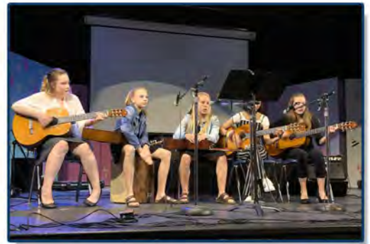
Creative Music Festival